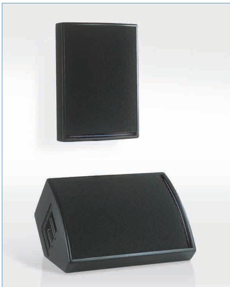
DS15S shown in FOH and stage monitor settings

The DS15S offers total flexibility between stage monitor and F.O.H applications, with or without subwoofers. It stands out by its high efficiency and high dynamic capacity that creates an acoustic pressure/size ratio very uncommon on the market with peak level up to 136 dB SPL. The DS15S is recommended for large size areas and as delay complements in large P.A. systems.